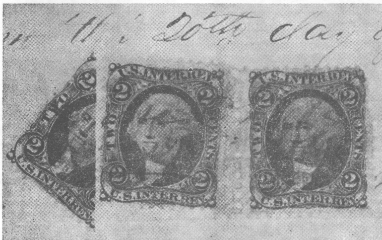
Figure 1 illustrates the left diagonal

onal half used as 1c" and "Vertical half used as 1c," being the green paper variety. A pair of original documents recently acquired furnishes us with a new discovery for our collection, being of the "regular paper" variety (R15c).