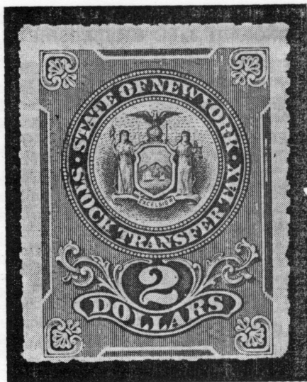
$2.00 1905 Carmine, roul. 11.

This shows much doubling, especially in letters around seal and in "Dollars."