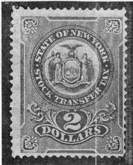
$2.00 1906 Carmine, perf. 12.

This shows much doubling, especially in letters around seal and in "Dollars."