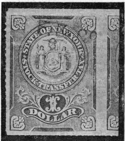
$1.00 1905 Ultramarine, roul. 11.

There are a lot of very nice double transfers found on the early issues of New York Stock Transfer Tax stamps. Three are described and shown.