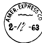
Figure 2. [AM-6]

Month, day, and year (when present) are separated by horizontal dashes 3/4mm in width.