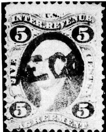
Figure 1. [AM-5]

The cancel shown by photo and sketch in figure 1 is a handstamp which originated from American Express Company. It is known affixed to Share Certificates from this particular company.