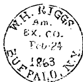
Figure 4. AM-16.

diameter, and is known to this author only in black. "W. H. Riggs.", in 2½mm lettering, falls within the circle at