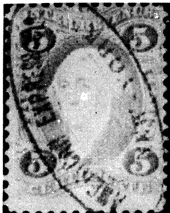
Figure 5. AM-19.

AMERICAN EXPRESS COMPANY Cancel No. AM-19 [New York].