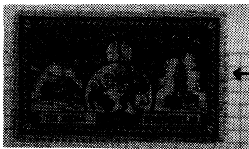
English printing-state 1 (W3-6)