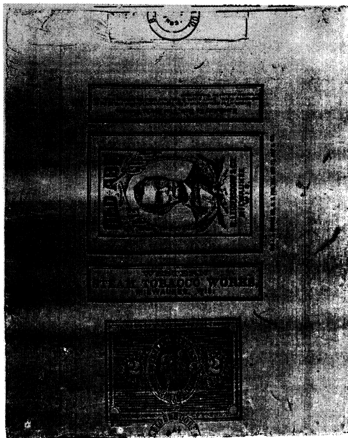
Series 1883 No. 12-12oz. Blue (1/2 actual size)

There are a total of 797 tinfoils listed herein. Please advise if you have further information.